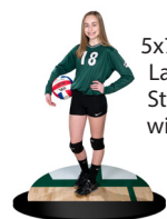
5x7 Acrylic Laser Cut Stand-Up with Base $24