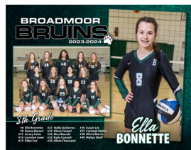
8x10 Memory Mate $16